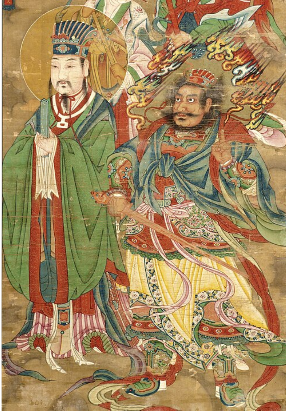
Figure 21. Qing dynasty painting titled Civil Official and Thunder God of the Celestial Palace , depicting a divine civil official and thunder god in military regalia. The official represents the wen masculine ideal, while the god represents wu manhood. Artist and date unknown. https://philamuseum.org/collection/object/42735

This depiction of wu masculinity echoes Gilmore's (1990) account of hombria in southern Spain, where masculinity is defined by courage, loyalty, and moral restraint (p. 44-46). Similar to wu , hombria is accessible across classes, yet most clearly visible among working-class men whose masculinity is measured through labor, courage and protection. Gilmore notes that someone with hombria is said to "have a lot of balls" (p. 46). Both wu and hombria frameworks reveal how moral virtue is tied to physical endurance and social responsibility. As Li & Jankowiak (2014) argue, wu