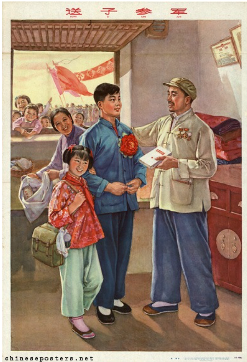
Figure 17. Propaganda poster depicting a family as they see their son off to the military. The painting is titled “Sending Off One’s Son to Join the Army.” 34 Artist: Chen Qiang 陈强. (1964). https://chinese posters.net/posters/pc-1964-011