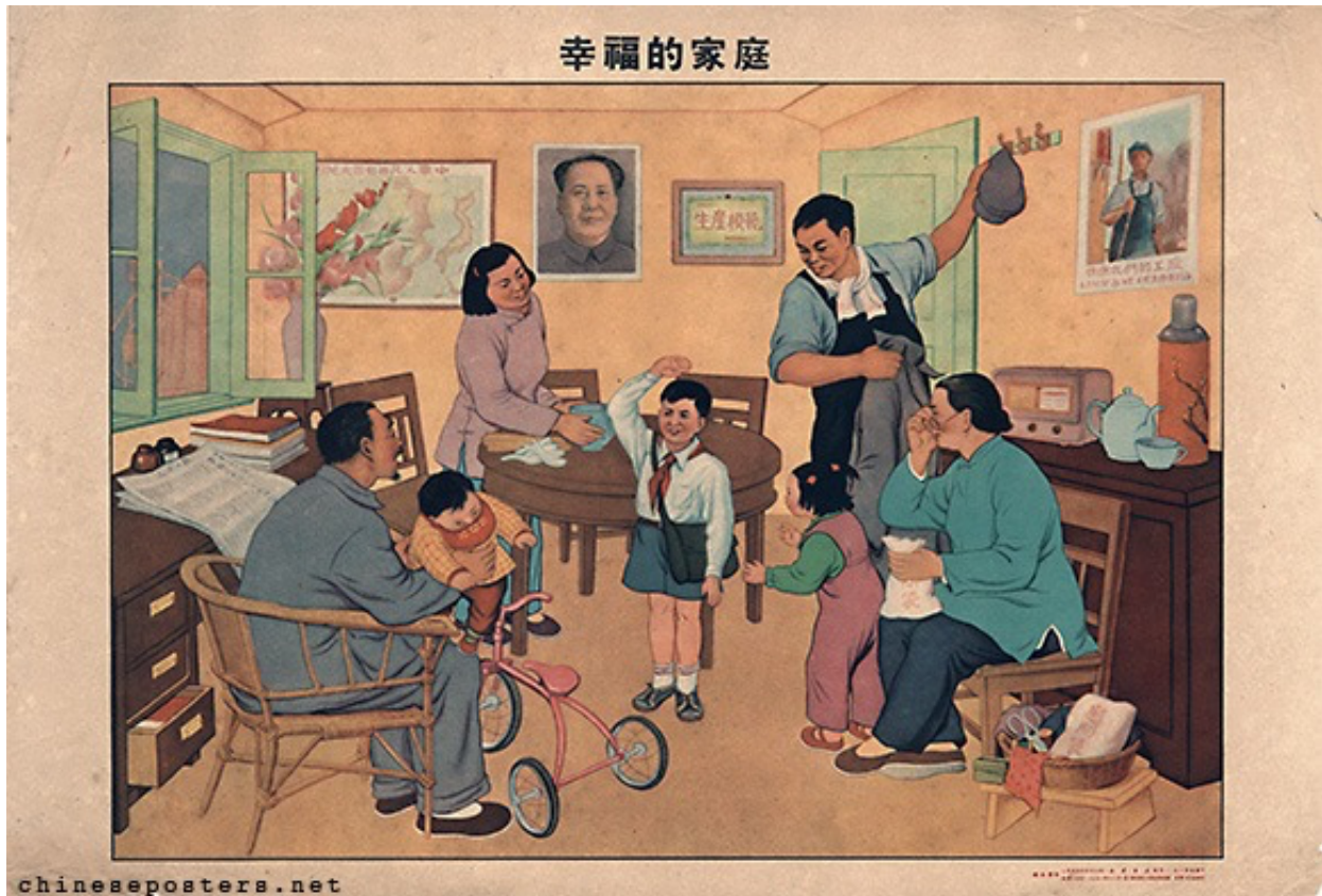
Figure 15. Chinese propaganda poster titled “Happy Family” 31 depicts a multigenerational household with a couple, three children, and two grandparents (presumably his parents). The father of the family hangs his hat as if returning from a day of work, suggesting his role as provider. Artist and date unknown. (circa 1950-70). https://www.commonprogram.science/art41.html

By framing singleness as a moral issue, this chapter examines the social expectations of “good” Chinese men and the qualities that constitute ideal masculinity, with particular attention to marriage. I argue that lifelong singleness remains largely unthinkable for most men in mainland China because it violates both social and moral codes. Singleness is thus deeply tied to questions of virtue, status, and the fulfillment of moral familial duty.