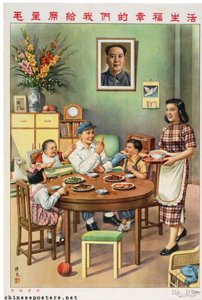
Figure 20. Chinese propaganda poster depicting an ideal Chinese family. Three happy children sit with their father at a dining table as their mother, his wife, serves them a meal. All eyes are on the father, while he points to the