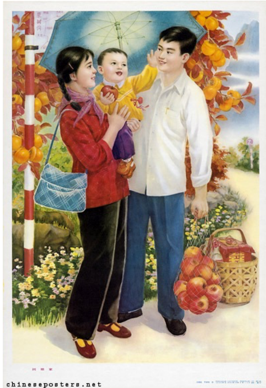
Figure 16. A propaganda poster depicts a Chinese family at an apple orchard where the man carries a large bag of apples that he presumably picked, positioning himself as a provider. The man's labor results in food for both his wife and child, as well as his in-laws, as the painting is titled "Returning to a Married Woman's Parents' Home." Artists: Feng Guozhu and Li Zemin (1983). https://chinese posters.net/posters/pc-1983-001

In China, providership carries similar symbolic weight, but it is often expressed through labor and financial contribution rather than hunting. A propaganda poster from 1983 (see Figure 16) offers a clear visual example. Created during the time of the OCP, the image depicts a small family of three visiting an apple orchard. The father, carrying a heavy sack of freshly picked apples, embodies the role of provider. His wife, holding their child, smiles approvingly as the child holds an apple with one hand and reaches out to tenderly touch his father's face with the other. The title, Returning to a Married Woman's Parents' Home , reinforces the relational structure of